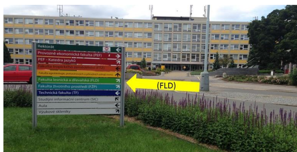
Figure 2 Follow the green sign indicating FLD