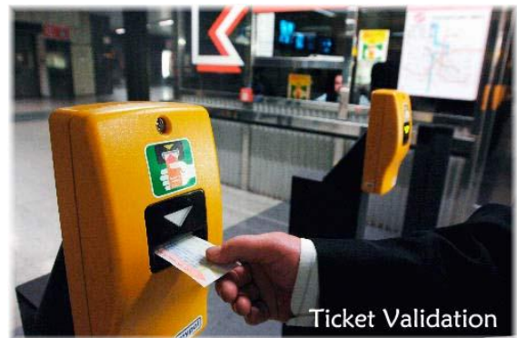
Validator in metro