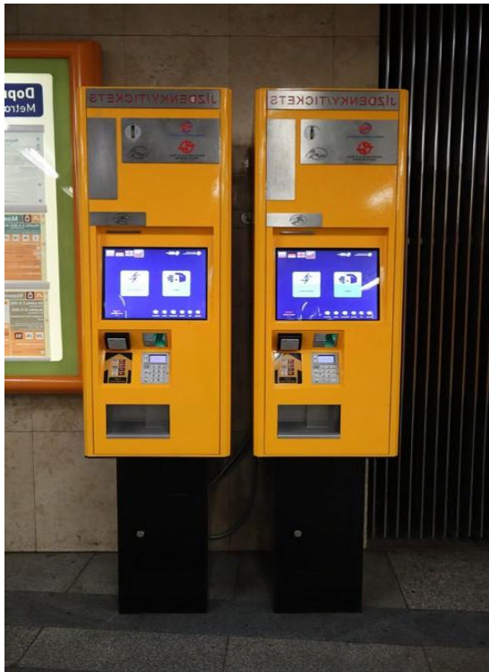
Classic Ticket Machines